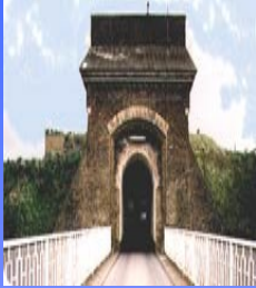
Dover Immigration Removal Centre

“My friend, I feel that I am locked up in a room and the keys are lost.