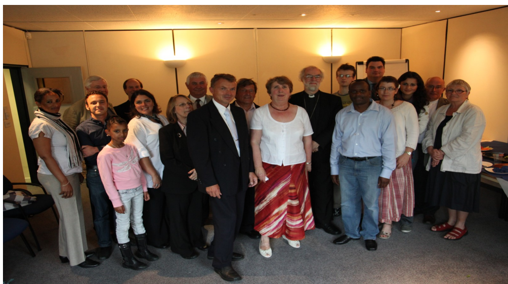
DDVG staff, committee members and the Archbishop of Canterbury

On Saturday 11 th September 2010, the Archbishop of Canterbury Rowan Williams paid a visit to the Dover Detainee Visitor Group (DDVG). A patron of the charity since 2006, Dr Rowan Williams visited the charity's office in Dover to find out about its work helping migrant Detainees. Whilst at the DDVG office, Dr Rowan Williams met with DDVG staff, the Chairperson and Trustees, followed by lunch with current visitor volunteers. This visit was an opportunity for Dr Rowan Williams to gain first-hand experience from volunteers about the work of the DDVG and their impact on the lives of detainees. The visit has also raised the profile of the DDVG in the local community.