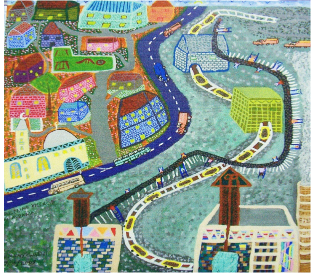
Albanian Coalmining Village (Albania) Created by a detainee